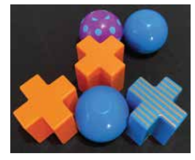
19. What piece can you add to the bottom row to complete its pattern?