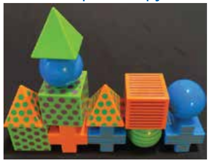
16. Separate the towers to make columns of each pattern. Which is the tallest? What blocks can you add to make them even?

15. Can you rearrange the blocks to make a column of each shape, with pyramids on top?