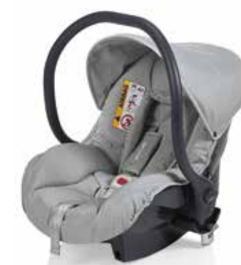
Smart Silverline (Gruppo 0+) optional, fitted with adapter for the Start frame Item 545 X - Col. 026