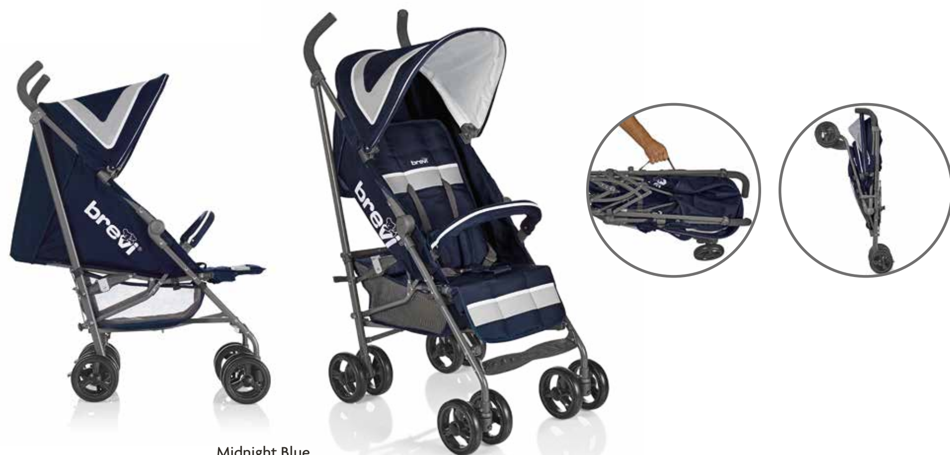
Midnight Blue Stroller Item 789 - Col. 239