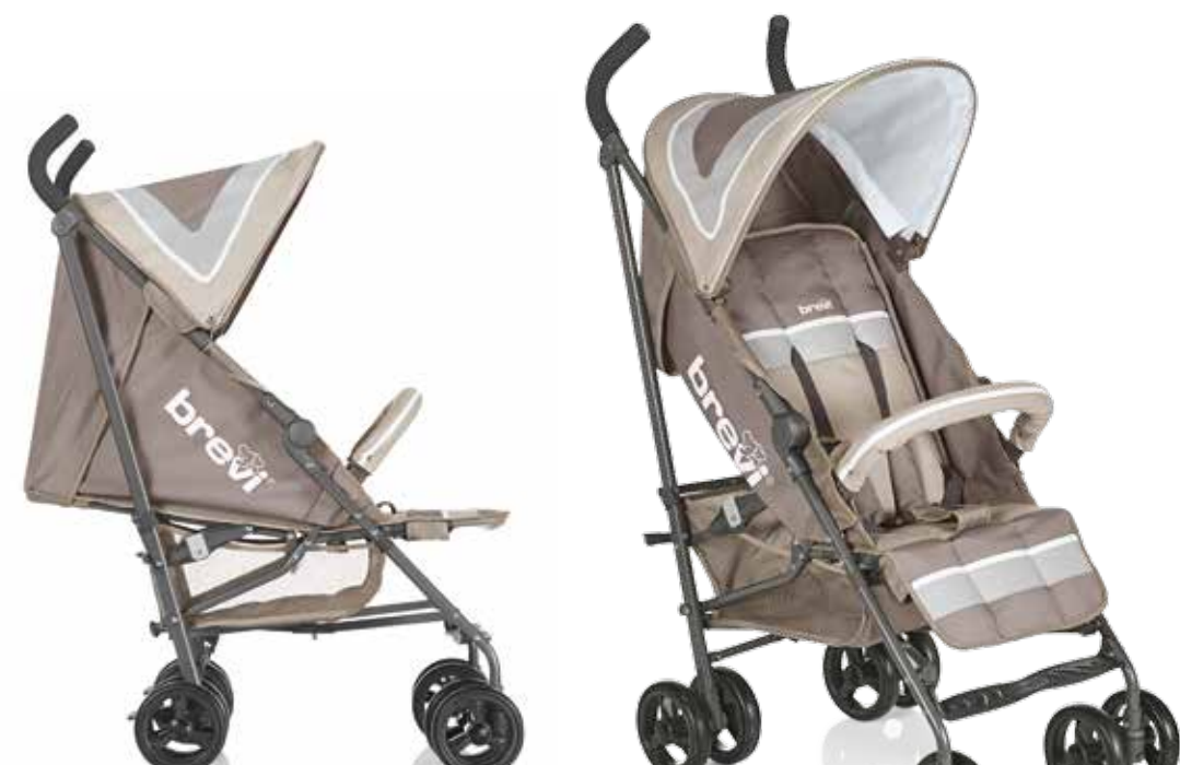
Grey Stroller Item 789 - Col. 450 Smart Silverline (group 0+) optional, fitted with adapter for the Start frame Item 545 X - Col. 026