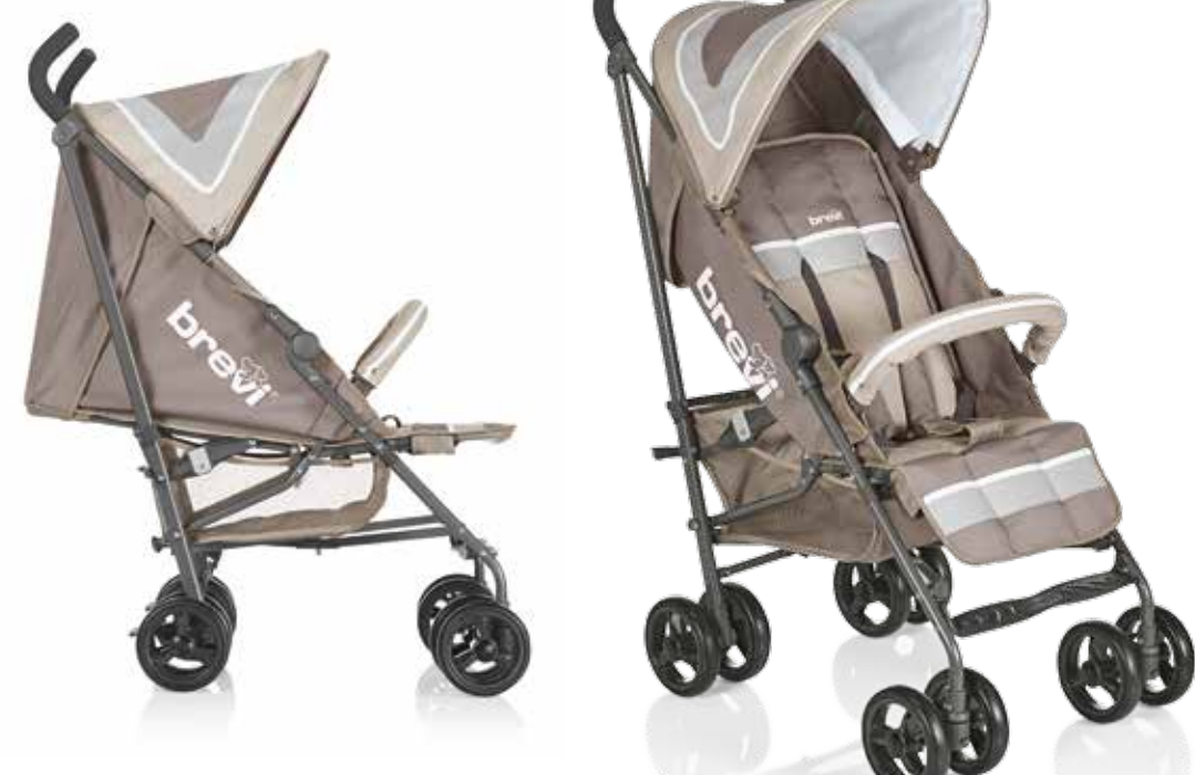
Dove Stroller Item 789 - Col. 398 Smart Silverline (group 0+) optional, fitted with adapter for the Start frame Item 545 X - Col. 026