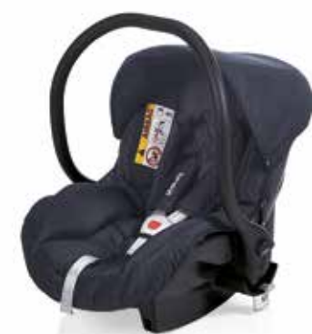
Smart Silverline (group 0+) optional, fitted with adapter for the Start frame Item 545 X - Col. 002