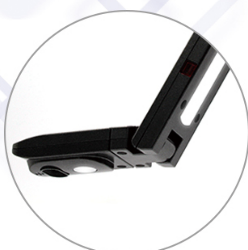
LED with Softbox