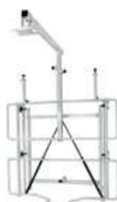
Mounts and brackets – page 32