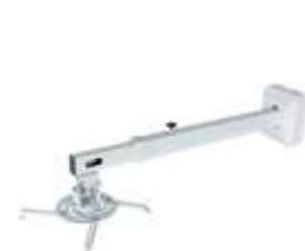
Projector mounts – page 30