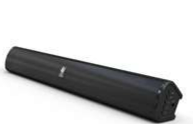
Soundbar – page 38