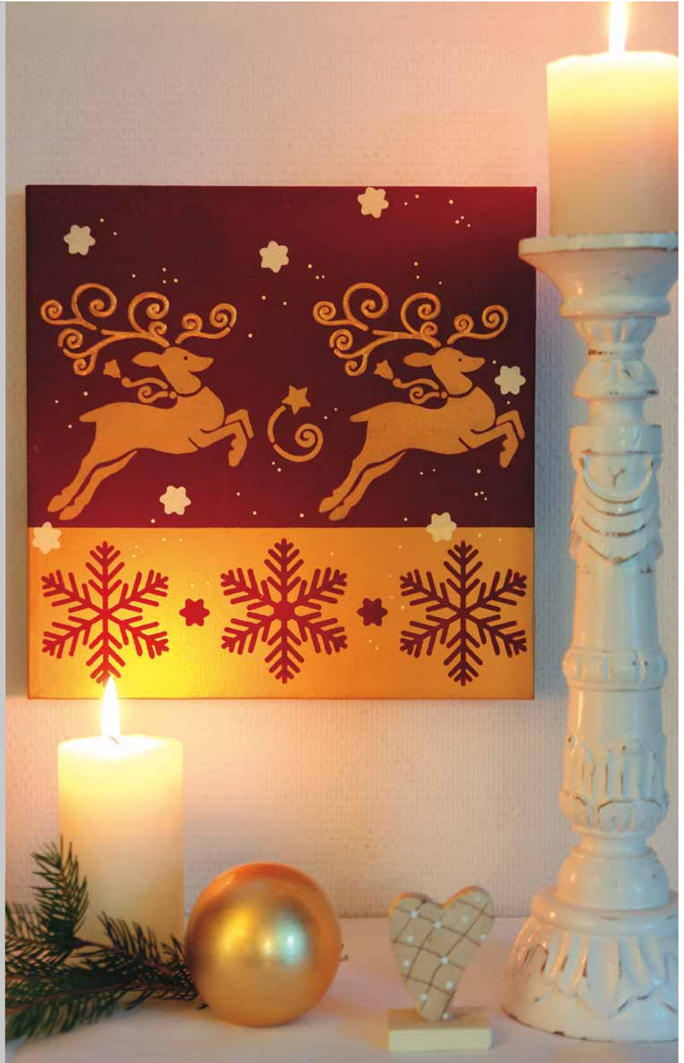
Stylish advent decoration