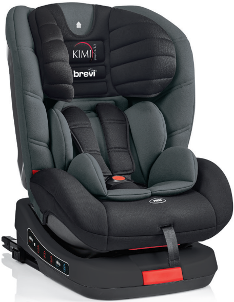
Grey Item 533 – Col. 077