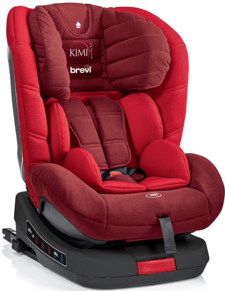
Red Item 533 – Col. 233