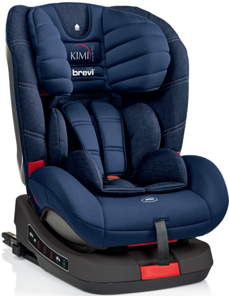
Jeans Item 533 – Col. 002