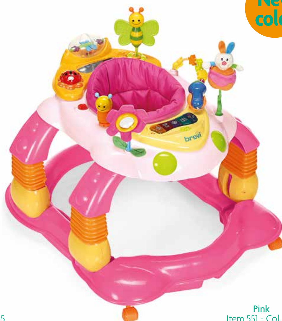
Pink Item 551 - Col. 168