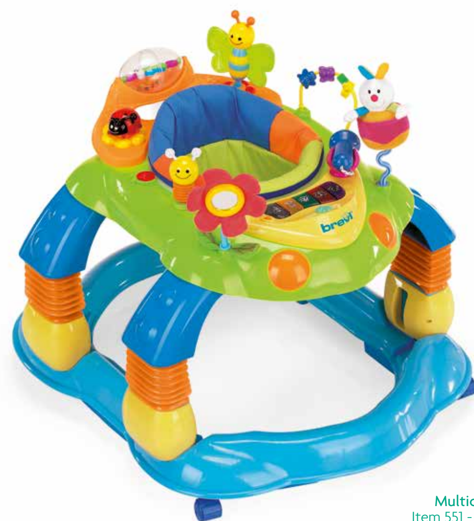
Multicolor Item 551 - Col. 345

Seat padding is machine washable and the activity center runs on two AA batteries (not included)