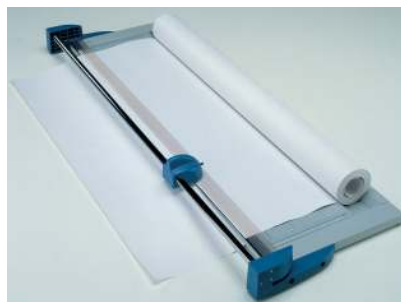
Convenient built-in paper rolls housing for easy cutting operations of large sizes of continuous paper