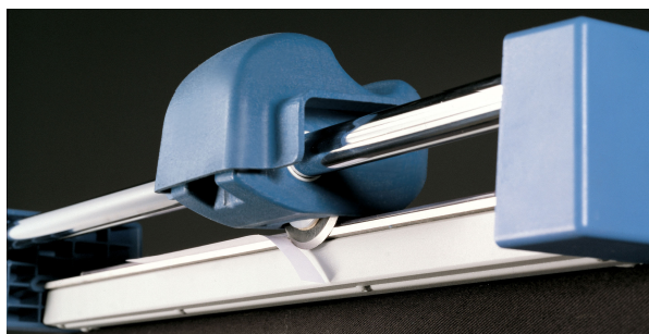
Special sharpened carbon steel blade to cut high thickness of paper